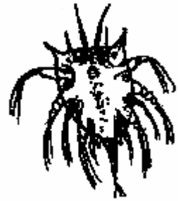
Nauplius of barnacle

Barnacles are hermaphroditic, each individual containing both female and male reproductive organs. Each barnacle has a way to pass sperm to neighboring barnacles to fertilize their eggs. Fertilized eggs are retained within the barnacle and hatch about ten days. The young develop in the mantle cavity until they reach the free-swimming nauplius stage. At this stage, the nauplius larva escapes and becomes a free living member of the zooplankton.