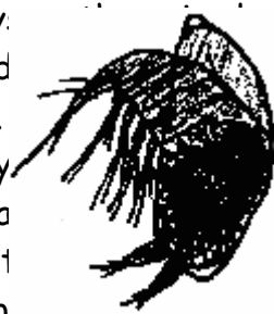
Cyprid larva of barnacle

The larva now enters the cyprid stage. The cyprid at this stage of its life cycle. The cyprid larva has a bivalve shell and large antennae. It develops cement glands in its head and crawls about the substrate, testing for an appropriate site.