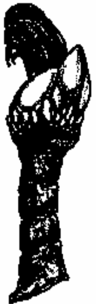
Adult goose barnacle